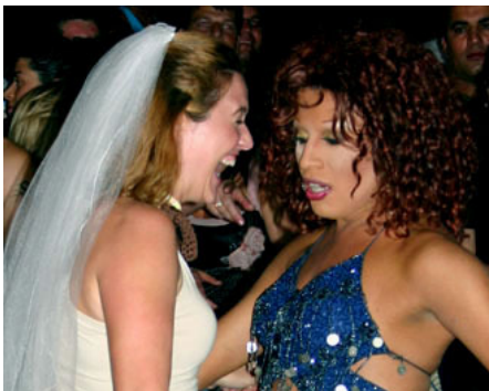
El Convento Rico

From chi-chi bars to rowdy clubs, here's where to throw a memorable bachelorette party